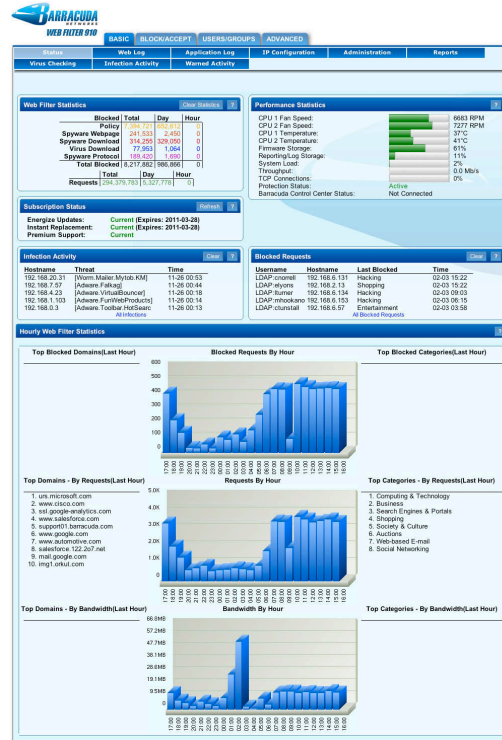
The Barracuda Web Filter monitors attempted policy violations, infected clients, blocked spyware, and virus downloads.

With no software to install or network modifications required, the Barracuda Web Filter is easy to set up. Energize Updates are delivered automatically by Barracuda Central, an advanced technology center where engineers work continuously to provide the most effective methods to combat the ever changing spyware and virus variants. Energize Updates include the latest spyware and virus definitions, along with content filter categories and security updates that are distributed hourly for continuous protection against the latest threats.